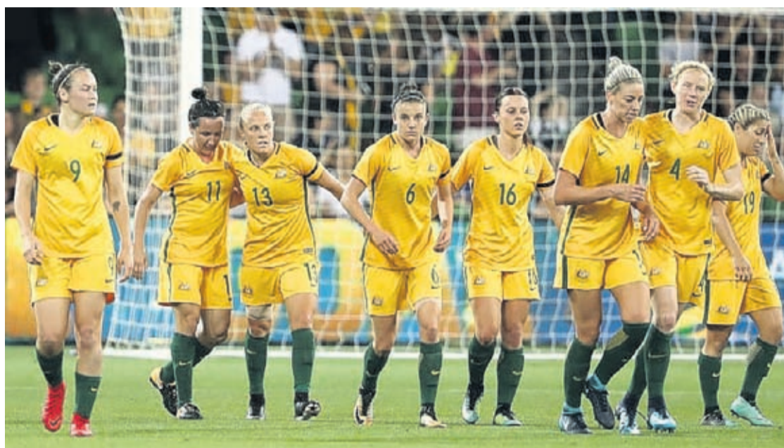
version y apoyo cu solamente tres aña pa prepara. E ganado

Hapon a experiencia como anfitrión di eventonan grandi, aunke ta prefera do ta anfitrión di e clima friu di juni pa juli di e fechanan preferible di juli pa augustus di FIFA. Colombia a cumpli cu e rekisitonan minimo di FIFA, pero e plan mester un cantidad significante di in-